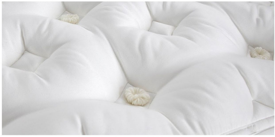
Fully tufted by hand and secured with wool rosettes to prevent shifting and settling over time, for a longer-lasting mattress.

The Pillow Top Mattress offers firm support but is soft enough for side, back or stomach sleepers.